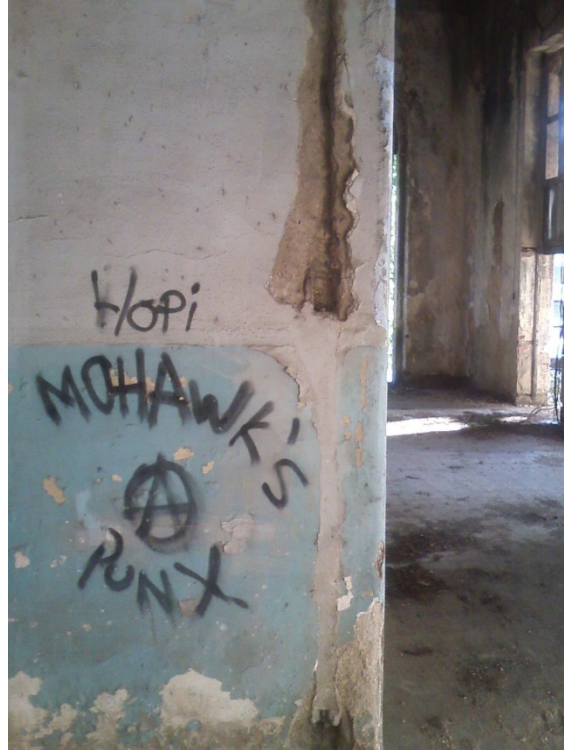
Figure 3. "Hopi Mohawk's Punx"

On yet another wall, the sense of transnational, trans-tribal solidarity was made clear by the slogan "Hopi Mohawk's Punx" scrawled around the symbol for anarchism. The Hopi and the Mohawk refer to two different Native American tribes. This graffiti is possibly evidence that representatives of these tribes had visited Aldeia Maracanã in the past or could indicate that members of Aldeia Maracanã were trying to evoke the "warrior spirit" ideal commonly associated with native North Americans. The Mohawk more so than the Hopi are renowned for being fierce warriors and are the inspiration behind the "Mohawk" hairstyle that has become a symbol of punk culture. Punks and indigenous land rights activists generally share an affinity for the principles of anarchism.