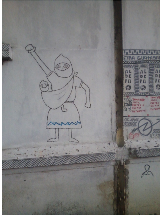
Figure 1 Indigenous female activist with child. Red text: “Luto contra o estado [I fight against the State]”. Bottom right text: “ocupar, resistir [occupy, resist]” around symbol for squatters’ rights.

Inside Aldeia Maracanã, graffiti helps to define the space as a radical, indigenous one. Interestingly, much of this graffiti connects the members of Aldeia Maracanã with transnational, pan-indigenous movements in Latin America. For example, one depiction of a female indigenous