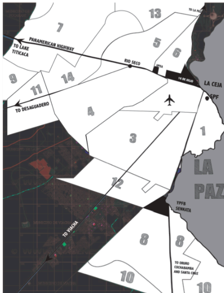
Figure 6.1: Map of El Alto

dynamics of the popular economy that emerged during the 1990s. Indigenous practices—including rotation and obligation—coupled with interpersonal relationships brought to the city from rural communities were vital to processes of self-construction. This has traced urban indigeneity into urban space in El Alto.