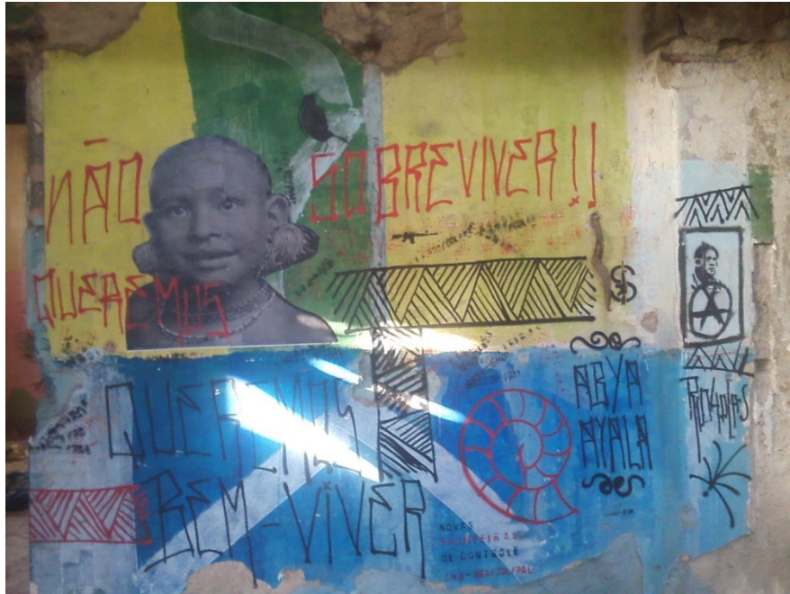
Figure 2. "Abya Ayala"

In a similar vein, the wall off the main chamber reads, " Não queremos sobreviver! Queremos bem-viver! [We don't want to survive! We want to live well!]" In the far-right corner, someone has written " abya ayala ". Abya ayala, or abya yala , is the name for the American continent used by the Kuna tribe who are indigenous to Panama and Colombia. This strategic use of " abya ayala " invokes a broader, pan-indigenous linguistic protest against the hegemony the language of the colonizers.